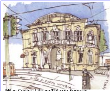
Milan Central Library/Palazzo Sormani